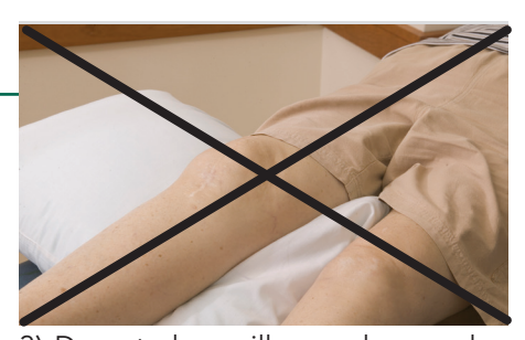
3) Do not place pillow under your knee.