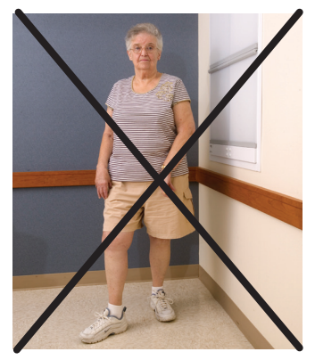
1) Do not pivot while standing.